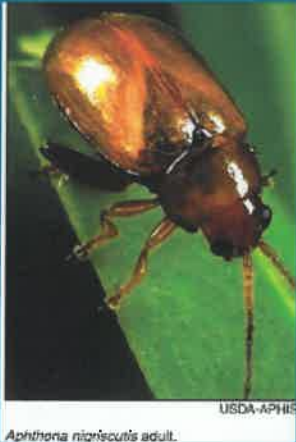
Aphthona nigrescens adult.

The Leafy Spurge Flea's only feed on Leafy Spurge. They are not a threat to any crops or native plants. They are self sufficient once released and completely take care of an entire patch of leafy spurge in a few short years. The Leafy Spurge Fleas are able to survive harsh winters and after the initial release need no new fleas need to be released. Through the Redwood SWDC there is no cost for the bugs and we will be glad to hunt some down for you.