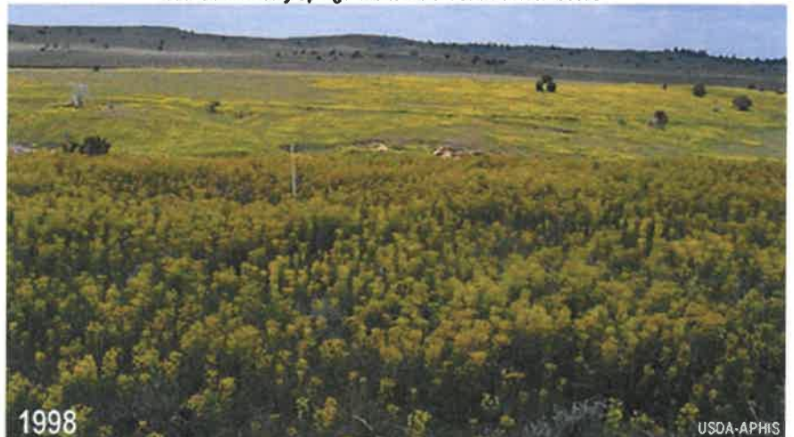
Reduction in Leafy Spurge due to introduction of Flea Beetle