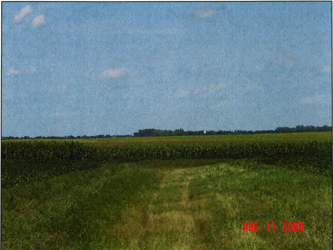
Waterway at Southwest Research and Outreach Center near Lamberton, MN.

Since 1978, the Redwood SWCD has helped landowners put conservation on the land through grassed waterways, terraces, wastewater, and feedlot runoff control, erosion control structures, farmstead shelterbelts and field windbreaks as part of this program. Landowners can receive financial and technical assistance to implement the practices.